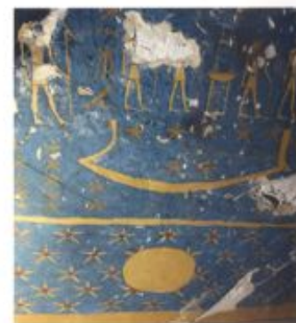
Painted astrological scenes from the ceiling of Karakhamun's burial chamber.