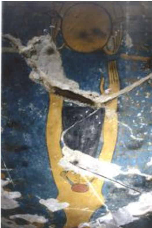
Painted ceiling of Karakhamun's burial chamber. This scene depicts the sky goddess, Nut.

Zahi Hawass, Secretary General of the Supreme Council of Antiquities (SCA), said that the team found the burial chamber of Karakhamun at the bottom of an 8m deep burial shaft. The chamber is in very good condition and contains beautifully painted scenes. The entrance to the chamber is decorated with an image of Karakhamun and the ceiling is decorated with several astrological scenes, including a depiction of the sky goddess, Nut.